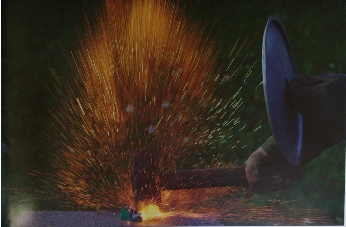
Ill, novel threats—like a lithium ion battery fire—can have big impacts.

hazardous materials or sabotage. Uncertainty about what is in any given, and now fire-damaged, container, compounded by data integrity questions, will complicate the response. Large amounts of heavy black smoke in the middle of a densely populated area raises public health concerns in two states, including for ferry passengers. Various cargo owners may decide to sue each other or the vessel owner, further slowing cargo and vessel disposition. Longshore workers may refuse to work until air monitoring deems it safe.