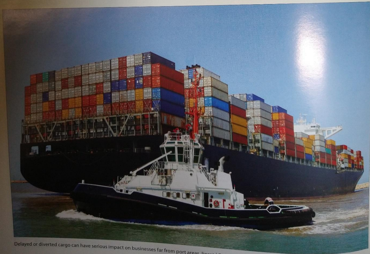
Delayed or diverted cargo can have serious impact on businesses far from port areas.

Additional considerations: The source of the fire might have been illegal or improperly stored