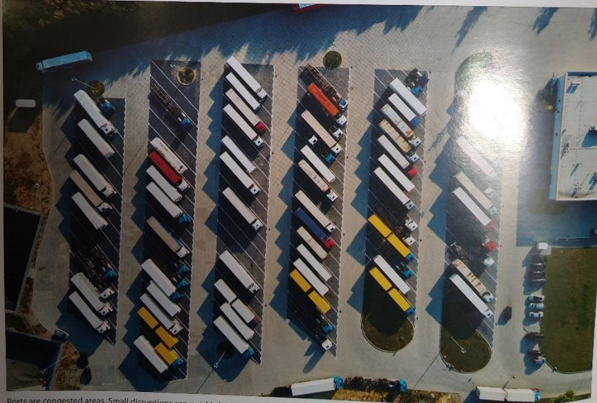
Ports are congested areas. Small disruptions can quickly have ripple effects.