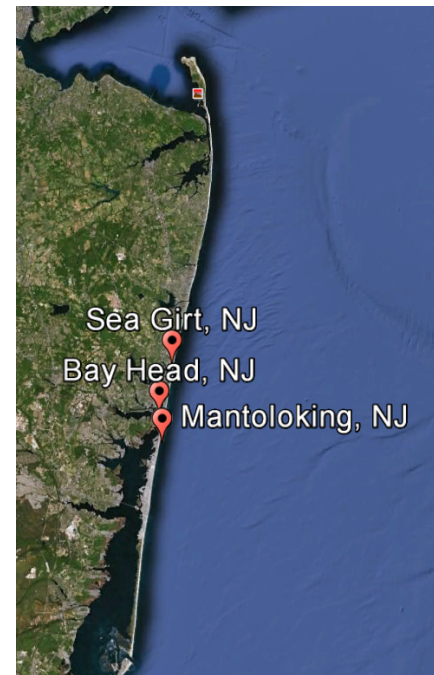
Figure 1: Site Location Map (Image: Google Earth)

The objective of the project is to compare the impacts of Hurricane Sandy in three New Jersey communities and to develop a better understanding of why each community was impacted to the extent that they were. The three communities selected for the analysis were Mantoloking, Bay Head, and Sea Girt. Less than ten miles separate the three communities; however the amount of observed damage varied significantly. The southernmost community, Mantoloking, was protected by a narrow beach and dune system and suffered the worst damage. The community of Bay Head which is located immediately to the north of Mantoloking was impacted to a much lesser degree, thanks in part to 1960's era seawall that protected three-quarters of the town. The third community, Sea Girt, only experienced minimal damage during Sandy due in part to a wide beach and dune system, and naturally higher elevations.