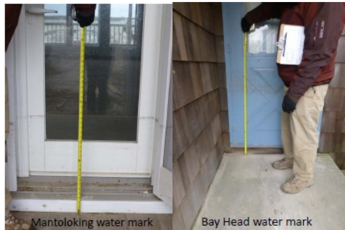
Figure 2: Watermark Data Collection

Over 400 structure evaluations have been completed and entered into a Microsoft Access Database. Each evaluation has accompanying photographs. In addition, 150 watermarks have been identified, recorded and logged into the database with an accompanying photograph. Watermarks were measured as the elevation above a convenient reference frame, with the reference frame surveyed in with the DGPS system at a later date. Concurrently, scour depressions are being surveyed and documented with photographs. All of the damage assessments and photographs are being ported into a GIS environment.