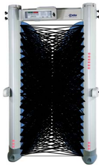
Figure 5. Illustrative example of walk-through metal detector areas of detection levels

The pilot experiments revealed that the metal detectors may have certain areas that are more difficult to detect than others. So instead of testing every object at every height, and trying to cover many orientations of each object for each security setting, we could create fewer more targeted tests, which would be more feasible to perform in an operational environment. These would test our hypothesized areas which we suspect may be more difficult to detect; these areas are illustrated in Figure 5. We think this is the case, as in addition to our pilot test findings, detectors have the most overlap at mid-height and less sensitivity at very short or very tall heights; in addition, by their very nature, detectors are more sensitive close to their sides, so the center of the machine is less sensitive than the left or right positions horizontally; in addition, machines are calibrated in the field to not pick up metals in the ground, so the lower height may also be less likely to detect small metal objects. So rather than including all heights, we created tests to determine which were the most difficult heights to detect, and could then narrow down to a few specific heights to then test object orientation.